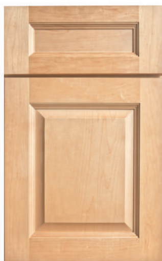
Pemberton RP 5-Piece (option)