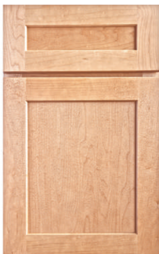
Winslow 5-Piece (option)