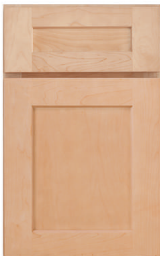
Dover 5-Piece (option)