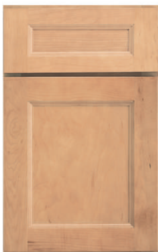
Pemberton 5-Piece (option)