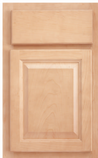
Concord Raised Panel

All styles are maple except where noted.